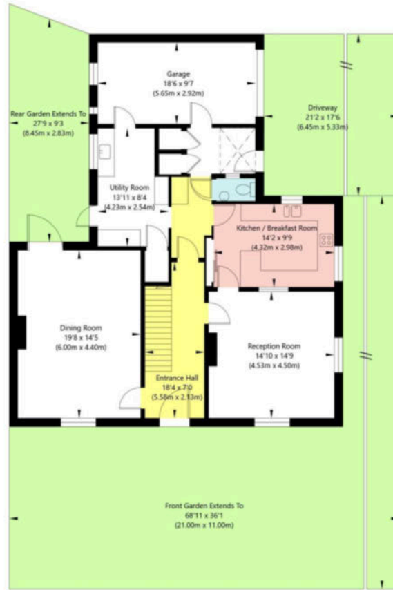
Ground Floor GROSS INTERNAL FLOOR AREA APPROX. 114.67 SQ M / 1234 SQ FT