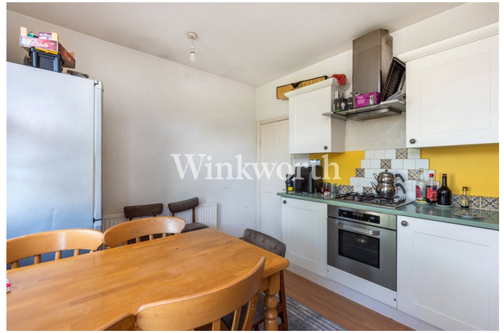
SOUTHEY ROAD, LONDON, N15 £450,000 LEASEHOLD