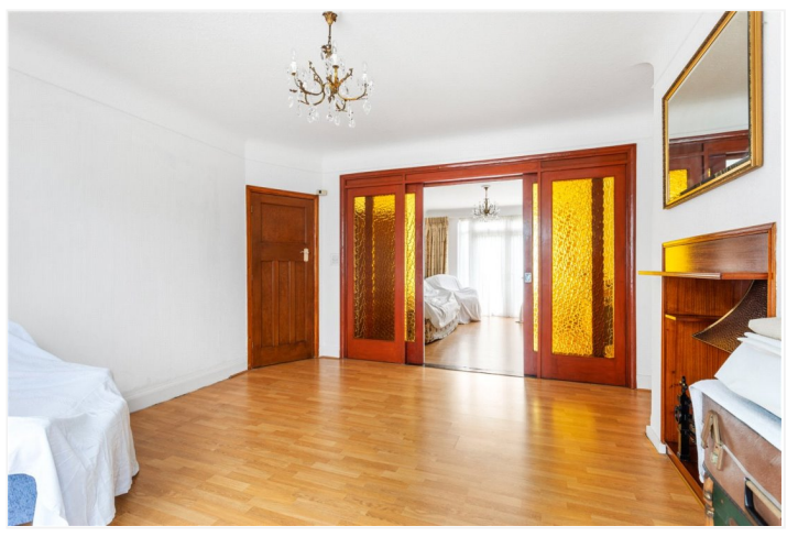
NETHER STREET, LONDON, N3 £780,000 FREEHOLD