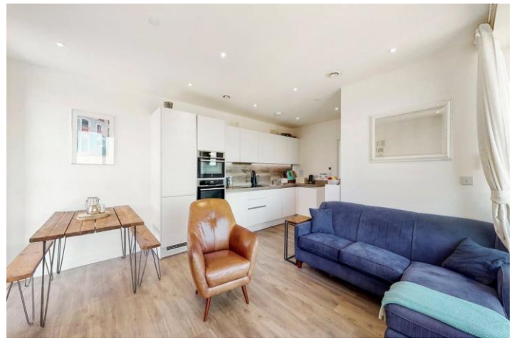
HAWFINCH HOUSE, MOORHEN DRIVE, LONDON, NW9 £445,000 LEASEHOLD