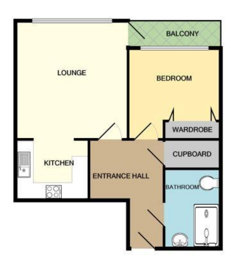
This Floor Plan is for guidance only and is NOT to SCALE Made with Metropix ©2020

There is ample residents and visitors parking on site. The building also benefits from a house manager, red care alert system throughout, communal lounge and a laundry room with top of the range appliances.