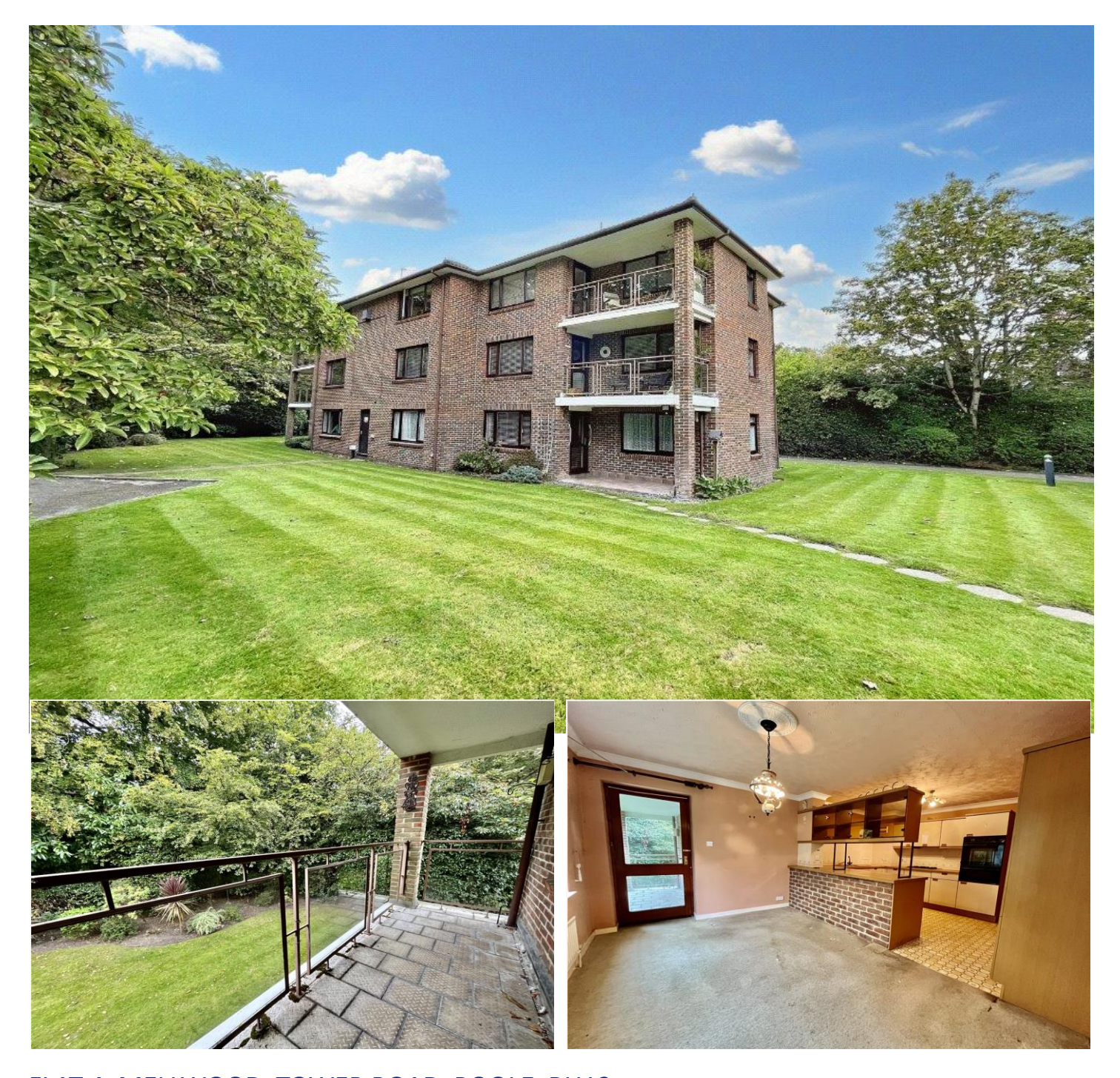
FLAT 4, MELLWOOD, TOWER ROAD, POOLE, BH13