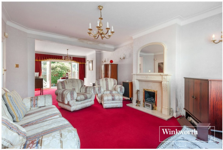
HIGHVIEW AVENUE, HA8 £799,950 FREEHOLD