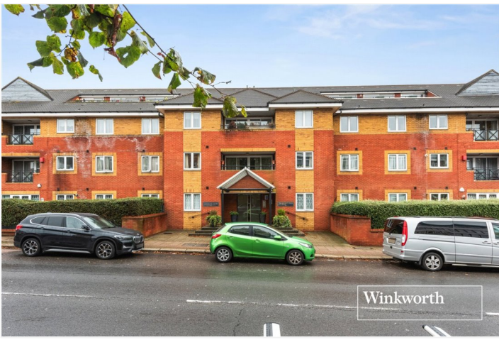
REGENTS PARK ROAD, LONDON, N3 £650,000 SHARE OF FREEHOLD