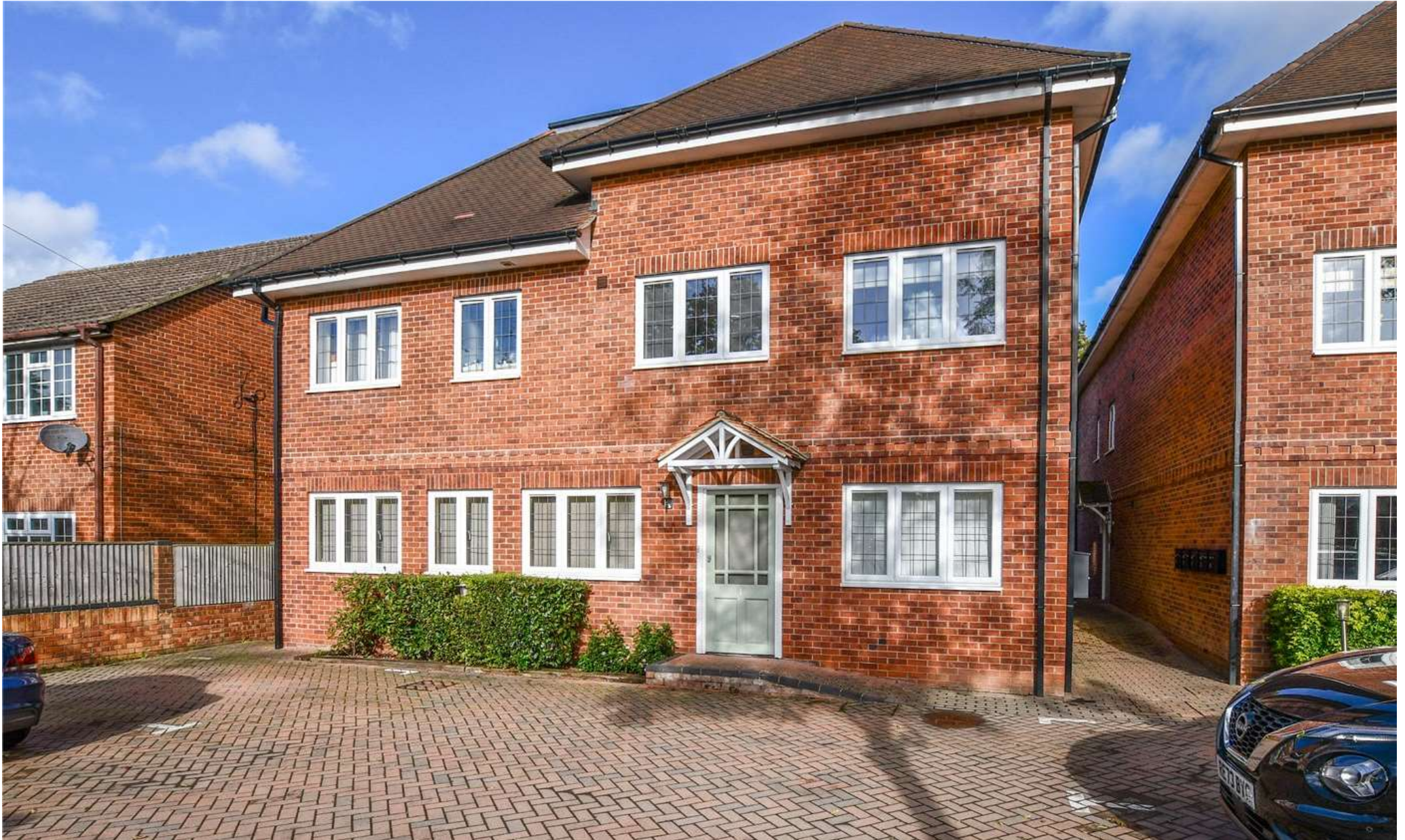
FLAT 1, 449 READING ROAD, WINNERSH, WOKINGHAM, BERKSHIRE, RG41 5HX £205,000 LEASEHOLD