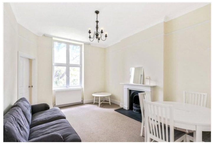
LEAMINGTON ROAD VILLAS, W11 £745,000 LEASEHOLD – NEW 999 YEAR LEASE