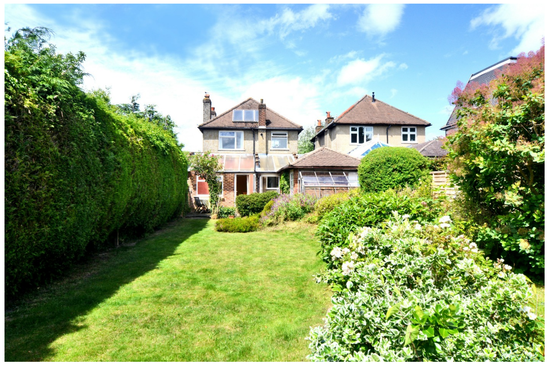
Under the Consumer Protection Regulations 2008, these Particulars are a guide and act as information only. All details are given in good faith and are believed to be correct at time of printing. Winkworth give no representation as to their accuracy and potential purchasers or tenants must satisfy themselves by inspection or otherwise as to their correctness. No employee of Winkworth has authority to make or give any representation or warranty in relation to this property.