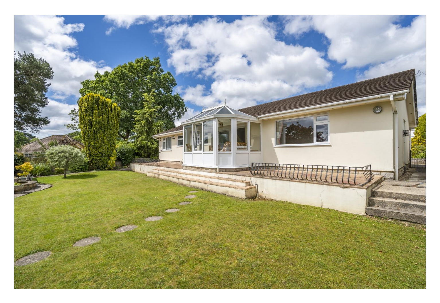
41 HAMILTON ROAD, CORFE MULLEN, WIMBORNE, DORSET, BH21 3PH £575,000 FREEHOLD