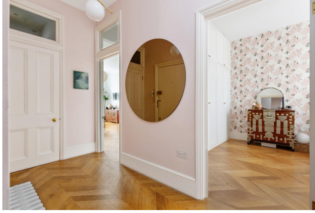
Newly Renovated | Long Lease | Two Double Bedrooms