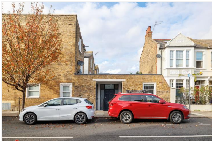
MUNSTER ROAD, SW6 £875,000 LEASEHOLD

Exquisitely presented throughout, this 1212 sq. ft spacious two double bedroom maisonette is situated on the ground and lower ground floor of this end of terrace property with the entrance on the sought after Fernhurst Road.