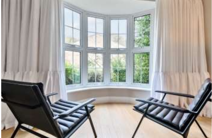
THE ORCHARD, GUIDE PRICE £700,000, FREEHOLD, NO FORWARD CHAIN

THIS IMMACULATELY PRESENTED THREE-BEDROOM, TWO-BATHROOM END-TERRACE TOWNHOUSE HAS BEEN EXTENSIVELY RENOVATED TO A HIGH STANDARD, OFFERING A MODERN, MOVE-IN-READY HOME. KEY UPGRADES INCLUDE THE REMOVAL OF ARTEX CEILINGS AND OUTDATED BATHROOM TILES, MAKING IT THE ONLY ASBESTOS-FREE PROPERTY IN THE ORCHARD. THE HOME FEATURES A NEWLY FITTED COMBI CENTRAL HEATING SYSTEM, ENHANCED CEILING AND FLOOR INSULATION, AND MODERN, STYLISH INTERIORS THROUGHOUT. THE SPACIOUS OPEN-PLAN LIVING AREA IS BATHED IN NATURAL LIGHT, WITH A CONTEMPORARY KITCHEN AND SEAMLESS ACCESS TO A PRIVATE SOUTH-WEST FACING GARDEN WITH A PATIO FOR ALFRESCO DINING. UPSTAIRS, THE PRINCIPAL BEDROOM BENEFITS FROM A NEWLY INSTALLED ENSUITE, ALONG WITH TWO FURTHER WELL-APPOINTED BEDROOMS AND A CONTEMPORARY FAMILY SHOWER-ROOM. EXTERNALLY, THE GARAGE HAS BEEN FULLY RENOVATED WITH A NEW ROOF AND CEILING BOARDS. LOCATED IN A QUIET CORNER OF THE ORCHARD, JUST A SHORT WALK FROM THE VILLAGE CENTRE AND SEAFRONT, THIS PROPERTY IS OFFERED WITH NO ONWARD CHAIN AND PRESENTS A RARE OPPORTUNITY TO PURCHASE A STYLISH, LOW-MAINTENANCE HOME IN A SOUGHT-AFTER LOCATION.