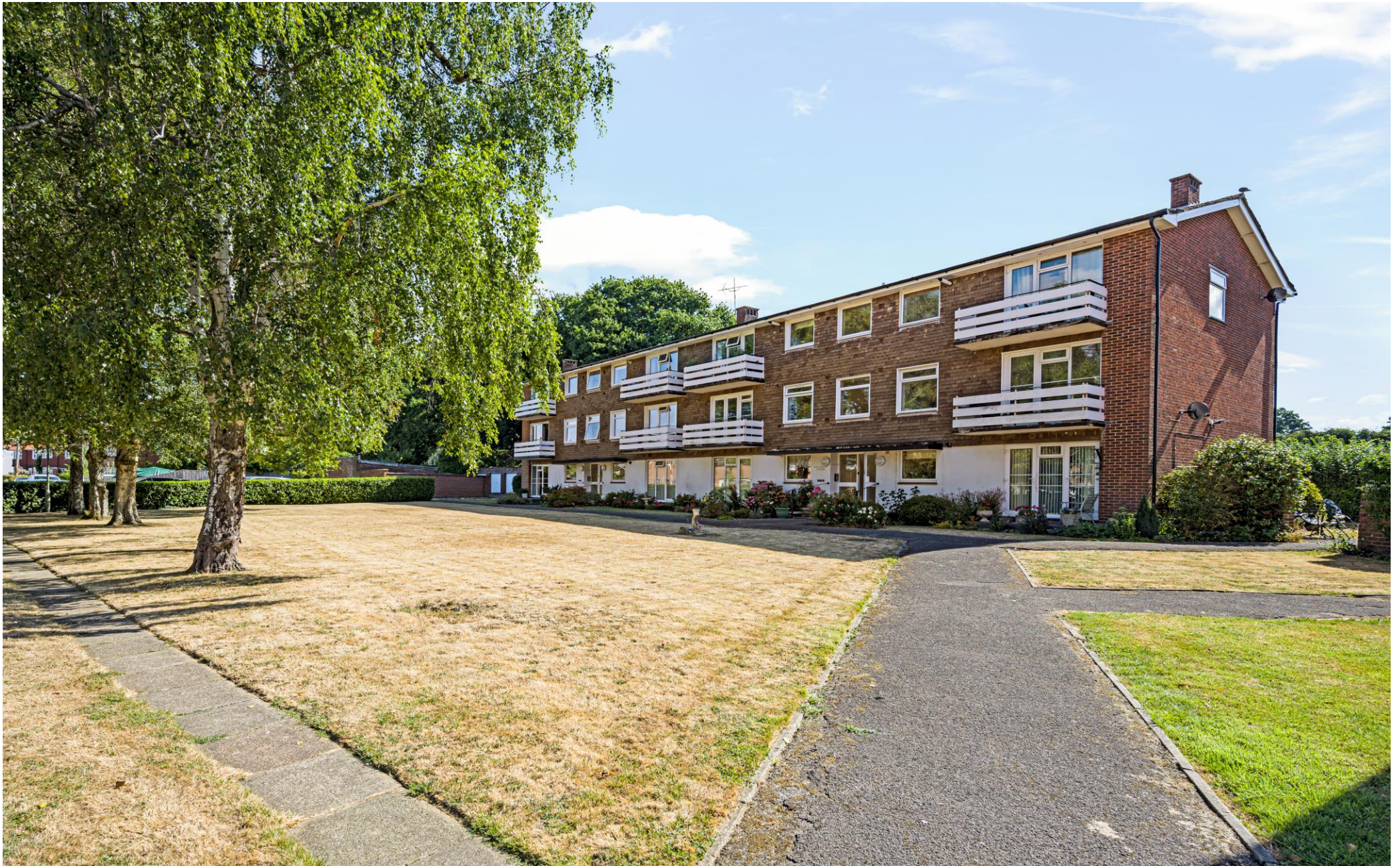
Reynolds Court, Romsey, Hampshire, SO51 5AX