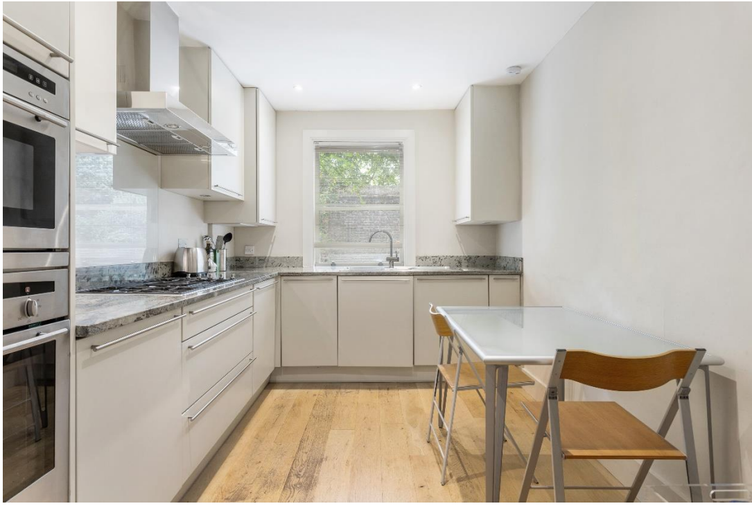
Excellent Condition | Private Terrace | Raised Ground Floor