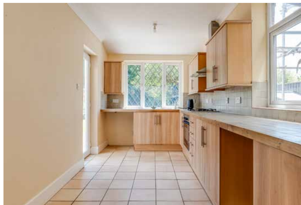
Why Holmfield Avenue?

Holmfield Avenue is conveniently located in Boscombe East enjoying leafy tree lined avenues with most of the properties built circa 1930. By contrast, Littledown is a more modern development built circa mid 80s. It is conveniently located just a short distance to Southbourne, the Royal Bournemouth Hospital and the Littledown centre with its indoor pool, gym, football pitches and plenty of after school activities such as gymnastics. There is a play park for the little ones, a lake and picnic areas. It also has a good primary and secondary schools making this a very family friendly area. Southbourne high street has been rejuvenated over recent years to include a range of independent cafés, restaurants and convenience shops along with excellent transport links and Pokesdown train station.