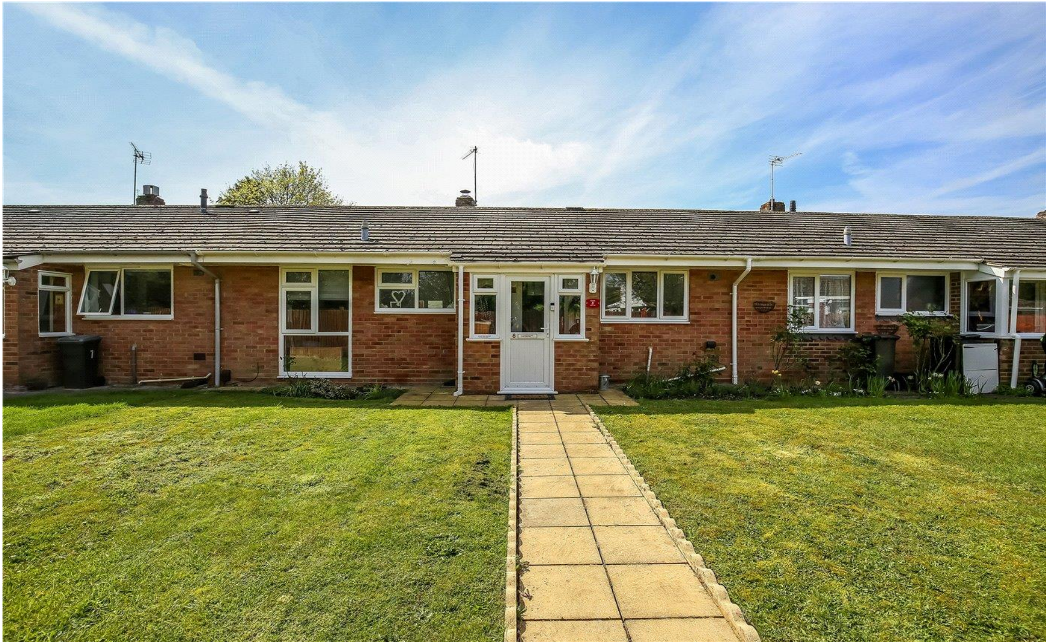
Ashley Close, Winchester, Hampshire, SO22 6LR