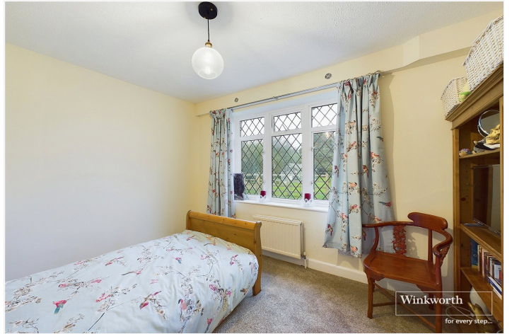
Winkworth for every step...