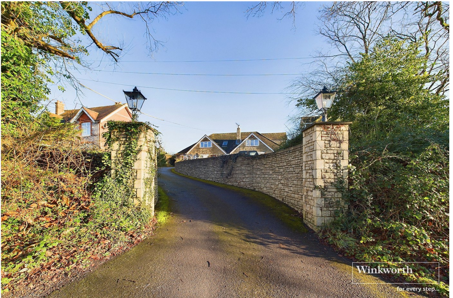
Winkworth for every step...