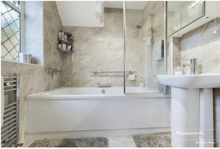
Winkworth for every step...