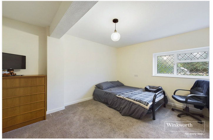
Winkworth for every step...