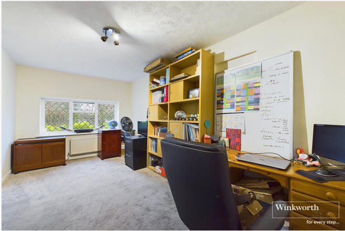
Winkworth for every step...