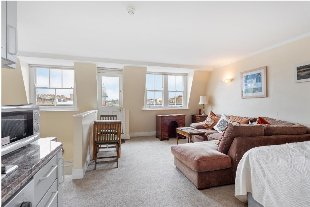
Split-Level | Private Terrace | Long lease