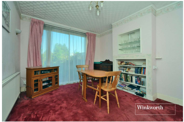
HILL CRESCENT, WORCESTER PARK, KT4 £675,000 FREEHOLD

AN APPEALING THREE BEDROOM SEMI DETACHED FAMILY HOME SITUATED IN A QUIET RESIDENITAL ROAD FEATURING A 100FT APPROX REAR GARDEN AND SCOPE FOR EXTENSION STPP