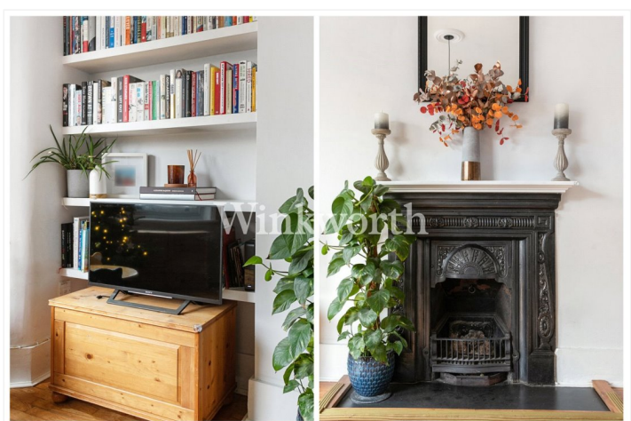
ST. ANN'S ROAD, N15 £525,000 SHARE OF FREEHOLD