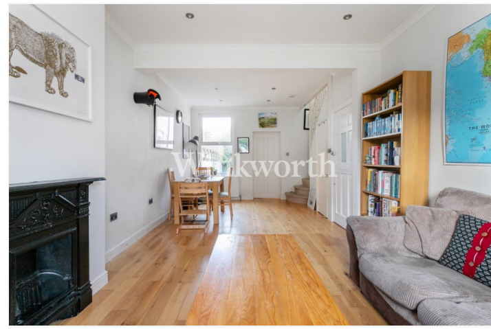
CONWAY ROAD, N15 £565,000 FREEHOLD