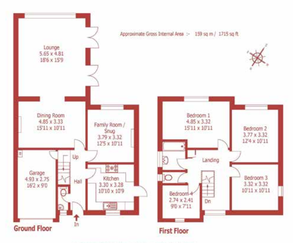
For identification purposes only, not to scale, do not scale