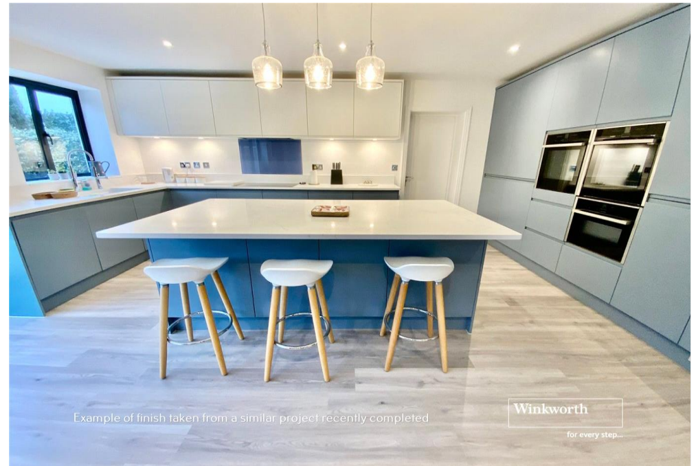
Example of finish taken from a similar project recently completed