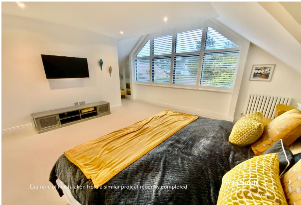
Example of finish taken from a similar project recently completed