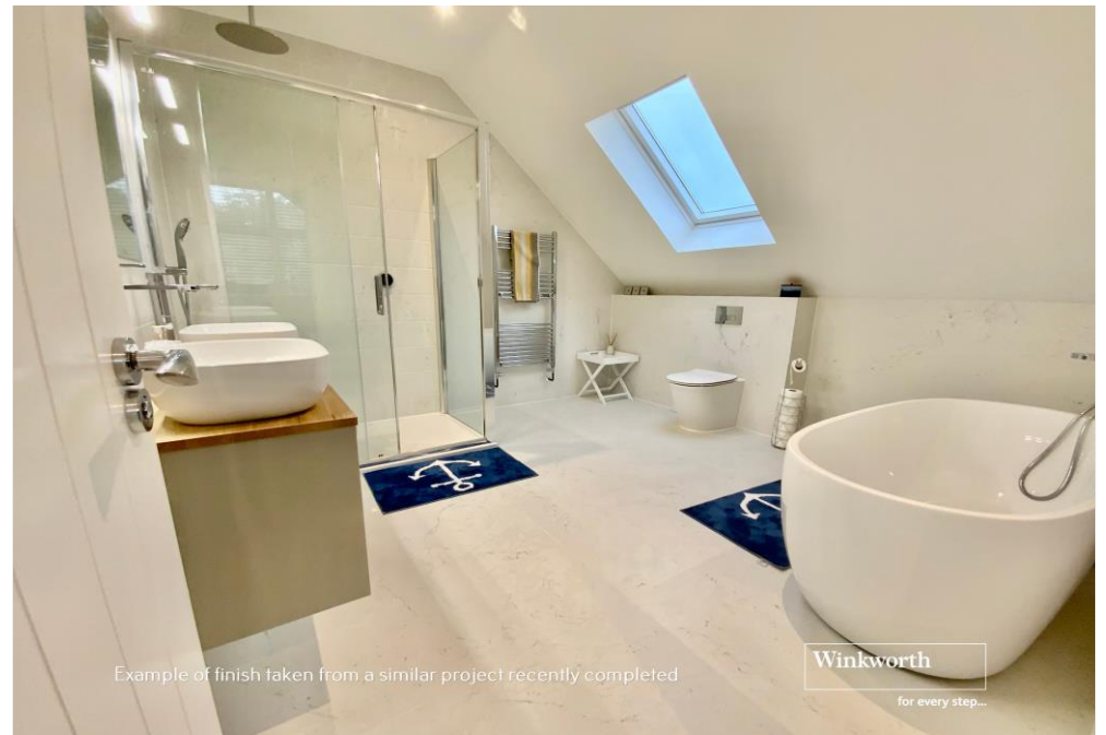
Example of finish taken from a similar project recently completed