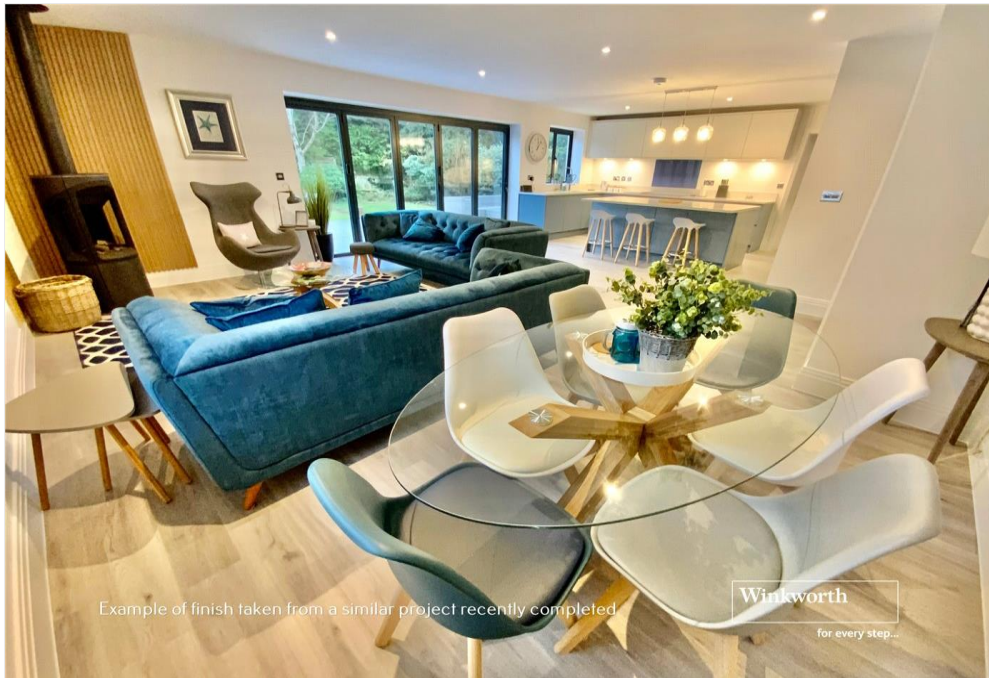
Example of finish taken from a similar project recently completed