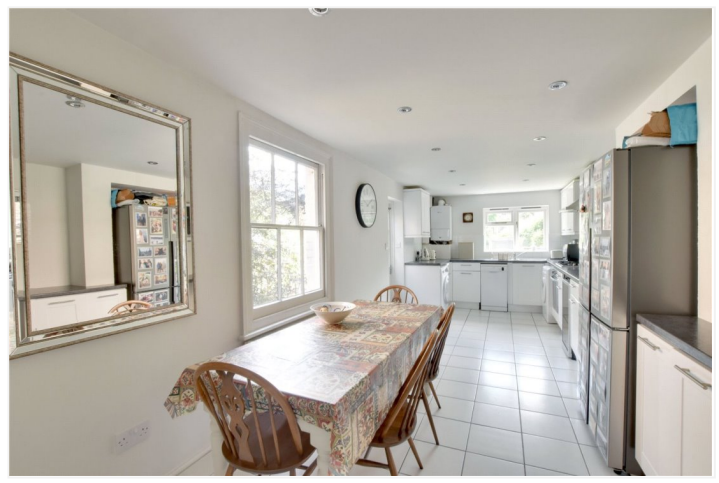
BOLDEN STREET, DEPTFORD, LONDON, SE8 OFFERS IN EXCESS OF £830,000 FREEHOLD

A BEAUTIFUL END OF TERRACE FAMILY HOME THAT IS PRESENTED IN SUPERB ORDER THROUGHOUT, THAT MEASURES C1291 SQUARE FOOT, THAT IS QUIETLY LOCATED MERE SECONDS FROM THE BEAUTIFUL BROOKMILL PARK AND A FEW MINUTE AWAY FROM ELVERSON ROAD DLR.