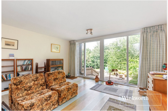
LINKS VIEW, FINCHLEY, LONDON, N3 £650,000 FREEHOLD