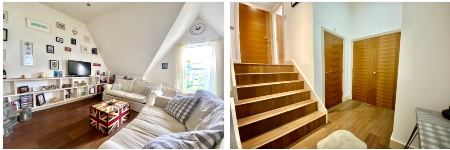
THE MANOR, CAVENDISH ROAD, BOURNEMOUTH, BH1