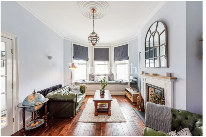
HEWITT ROAD, N8 £1,285,000 FREEHOLD