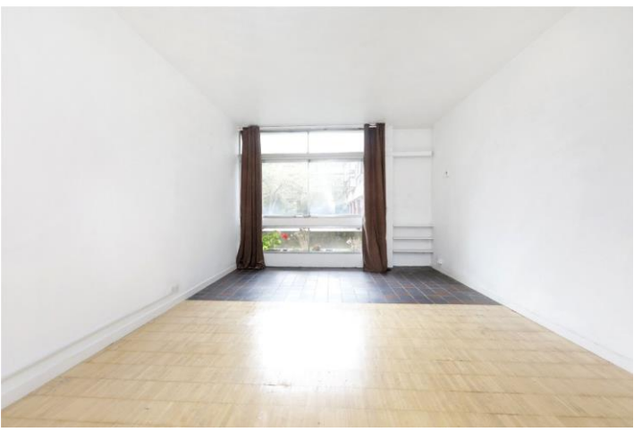
GOLDEN LANE ESTATE, EC1Y £320,000 LEASEHOLD APPROX. 172 YEARS REMAINING