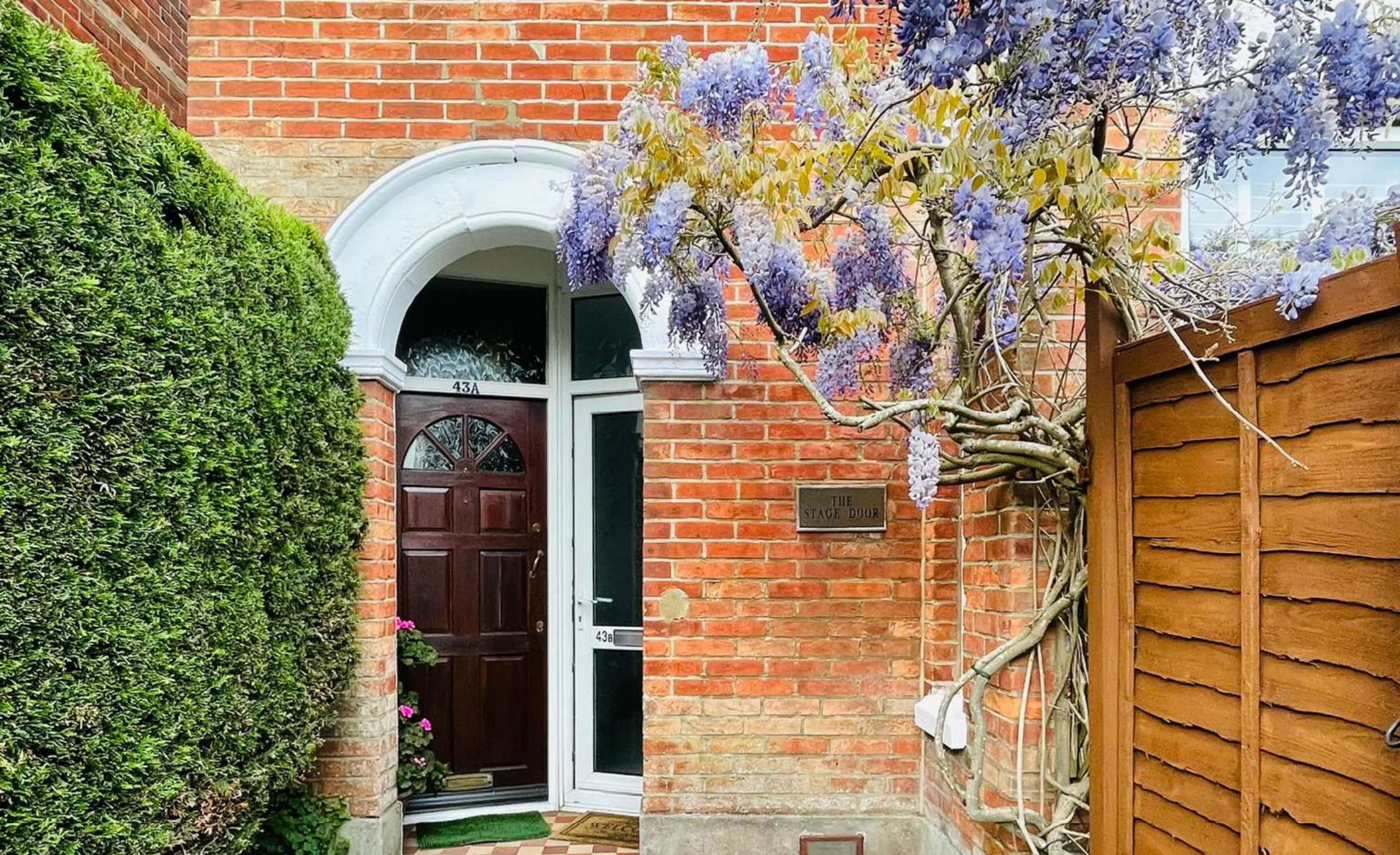
Flat B, 43 Talbot Road, Bournemouth, BH9 2JB Guide Price £200,000