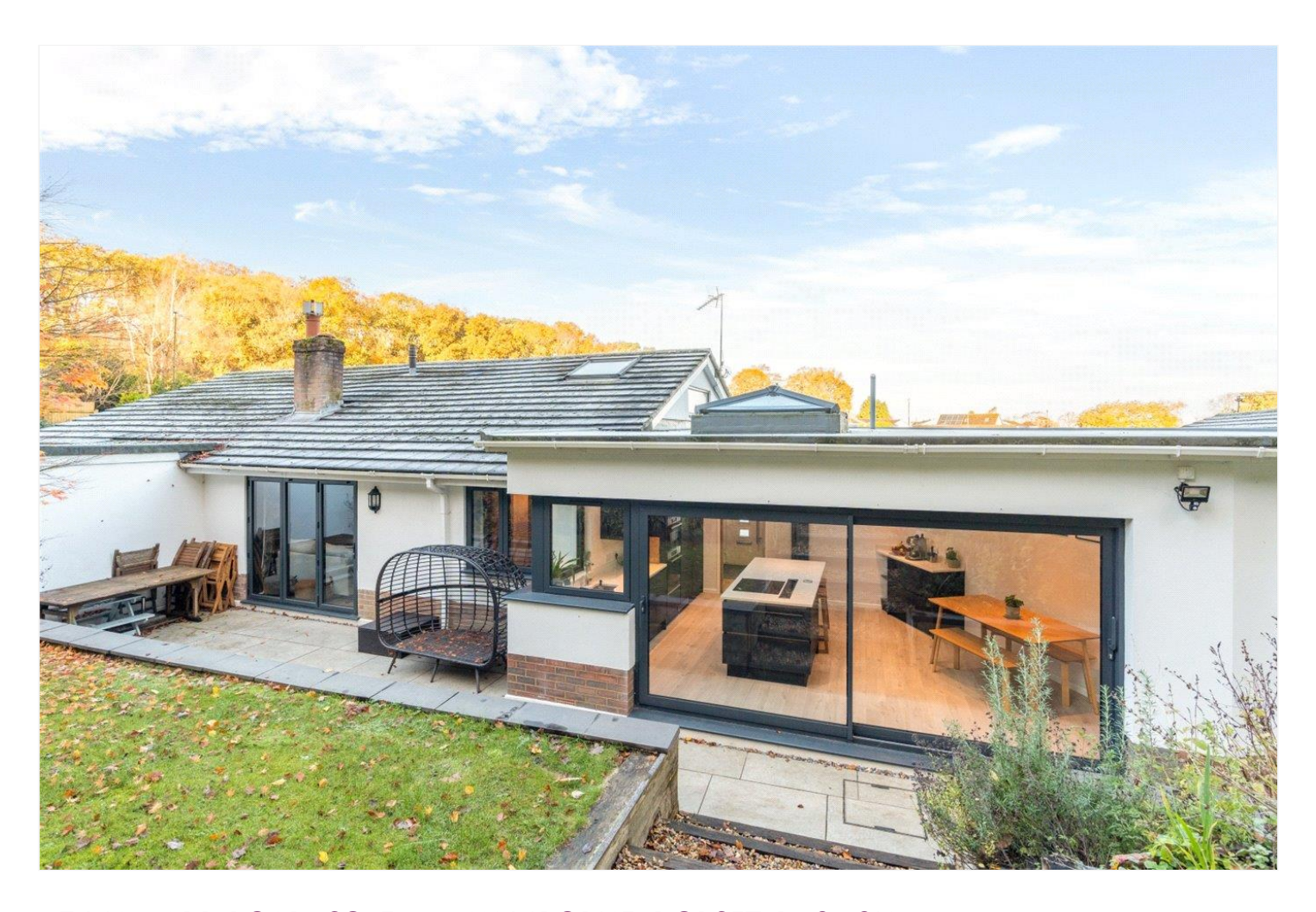
47 MALLARD ROAD, COLEHILL, WIMBORNE, DORSET, BH21 2NL £395,000 FREEHOLD