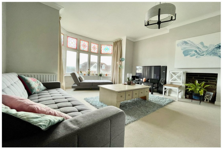
EARLE ROAD, BOURNEMOUTH, BH4