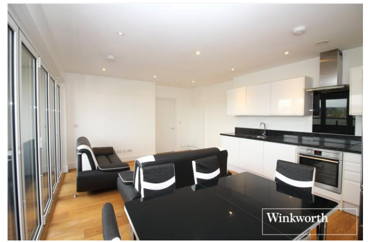
ELSTREE WAY, HERTFORDSHIRE, WD6 £305,000 LEASEHOLD