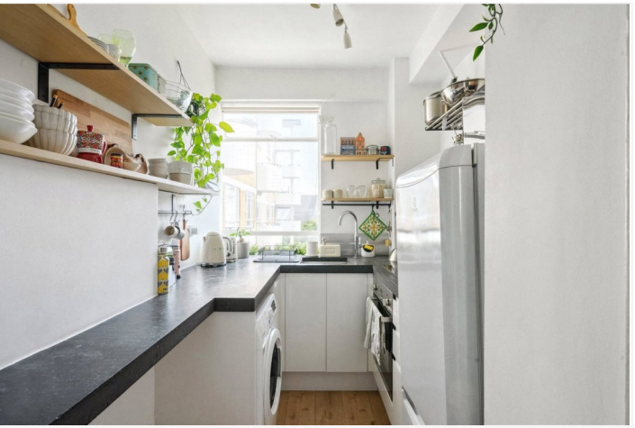
CHRISTCHURCH ROAD, SW2 £200,000 LEASEHOLD