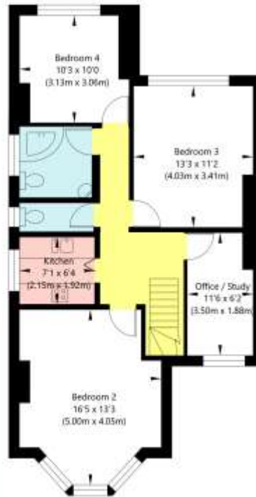
First Floor GROSS INTERNAL FLOOR AREA APPROX. 70.23 SQ M / 756 SQ FT