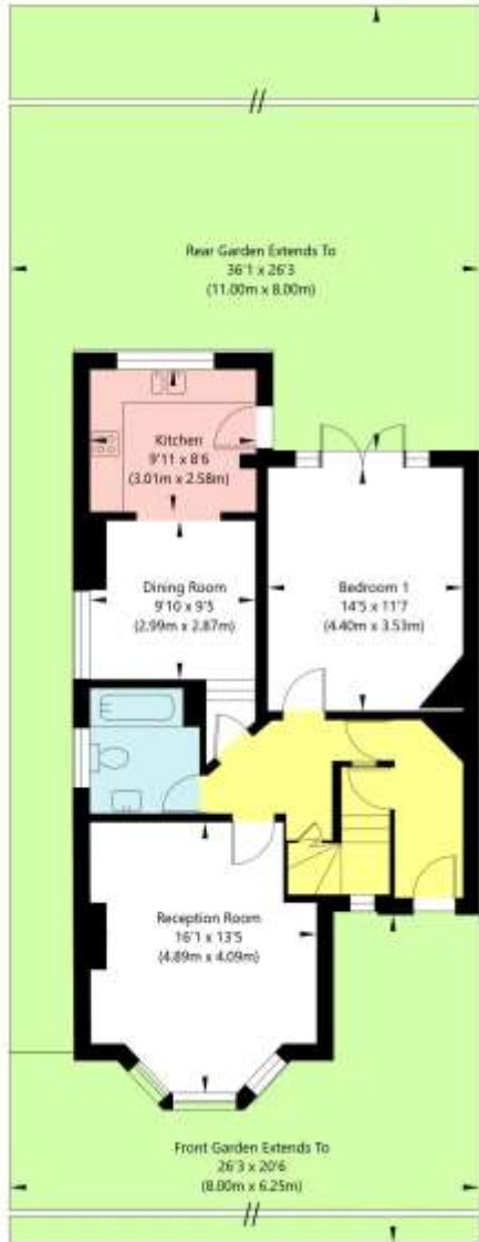
Ground Floor GROSS INTERNAL FLOOR AREA APPROX. 70.17 SQ M / 755 SQ FT