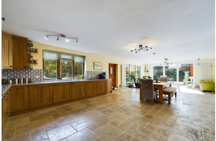
LANGARTH, 26 MILL LANE, YATELEY, HAMPSHIRE, GU46 7TN £1,300,000 FREEHOLD