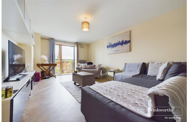
WATLINGTON STREET, BERKSHIRE, RG1 4AY OIEO £290,000 LEASEHOLD