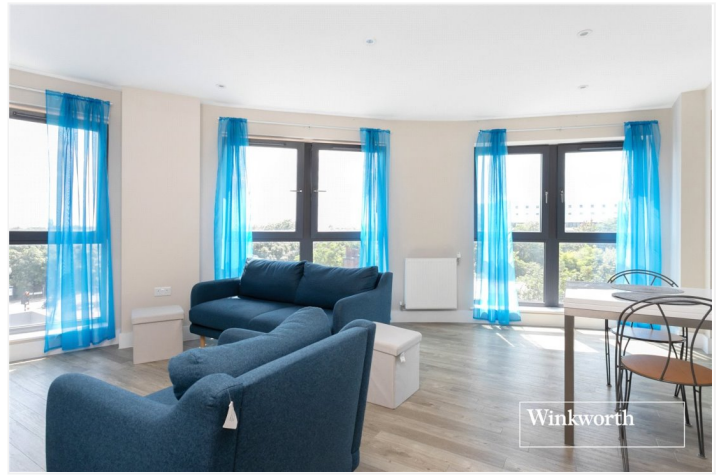
NETHER STREET, LONDON, N3 £425,000 LEASEHOLD