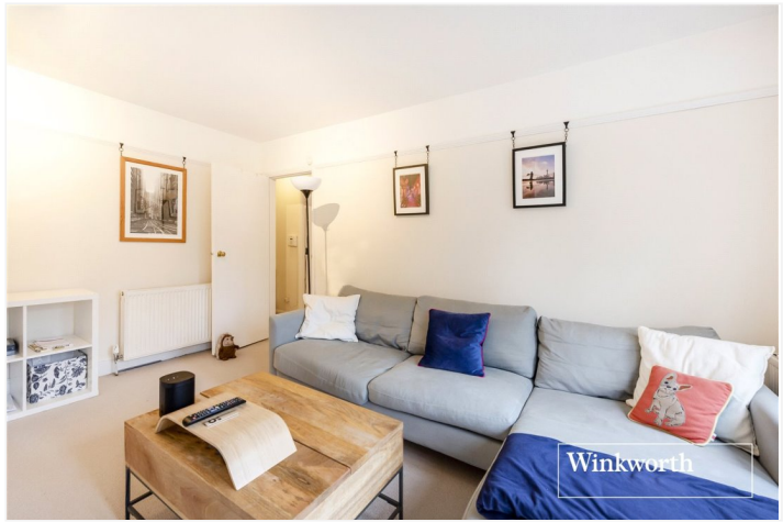
GRANVILLE ROAD, NORTH FINCHLEY, LONDON, N12 £425,000 LEASEHOLD