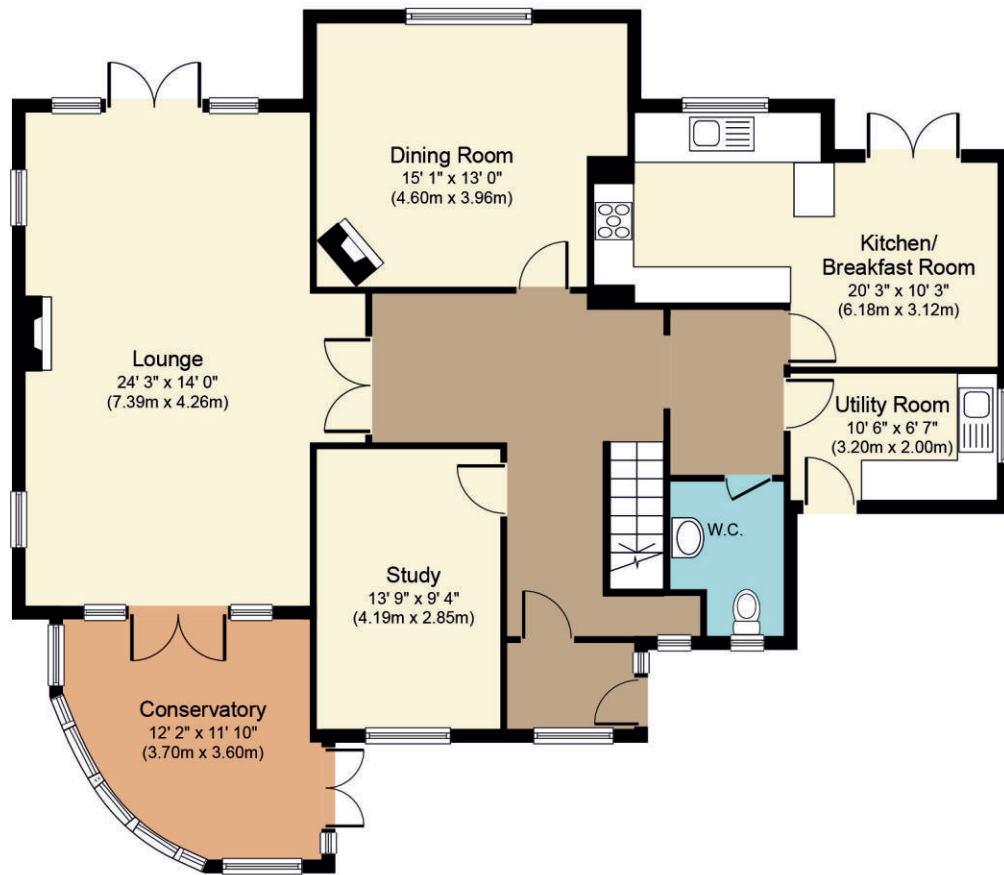
Ground Floor Approximate Floor Area 1,391 sq.ft. (129.3 sq.m.)