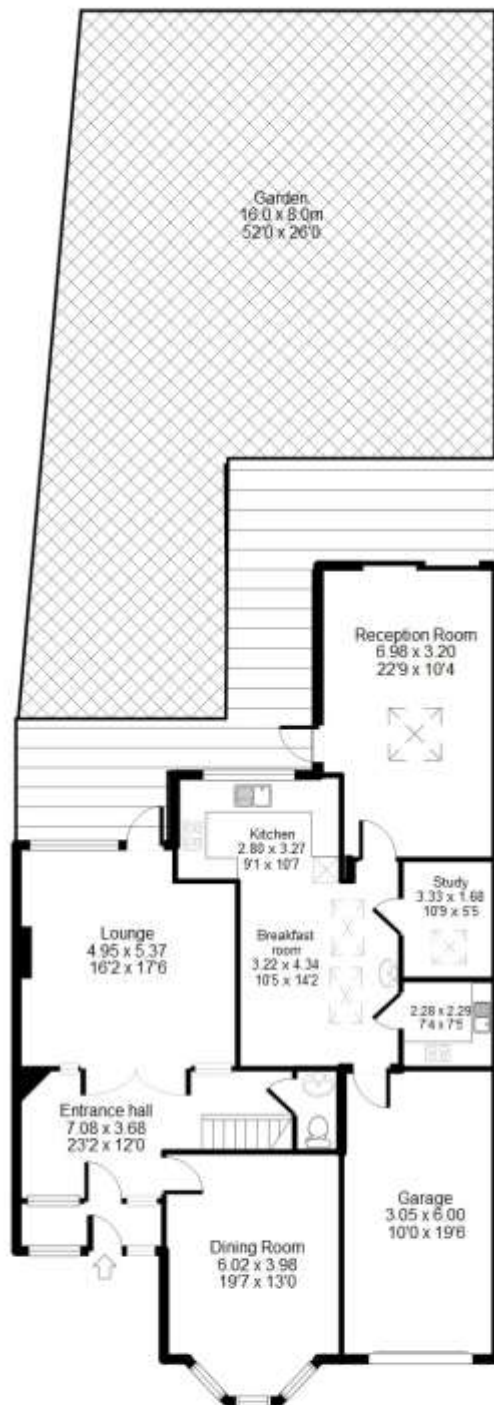
Approx ground floor area 152.91m 2 (1645sq.ft).