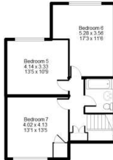
Approx loft floor area 56.15m 2 (604sq.ft).