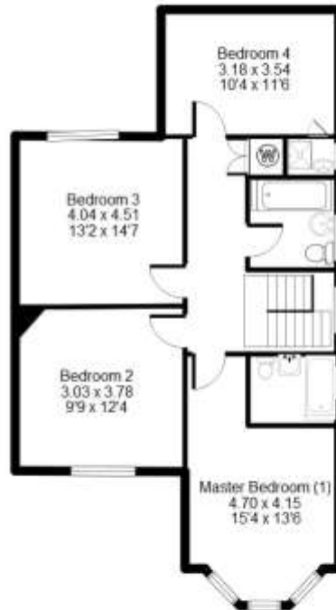
Approx 1st floor area 73.99m 2 (796sq.ft).

Total approx internal floor area 283.05m 2 (3046sq.ft).