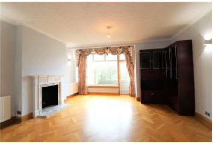
HODFORD ROAD, NW11 £2,000,000 FREEHOLD