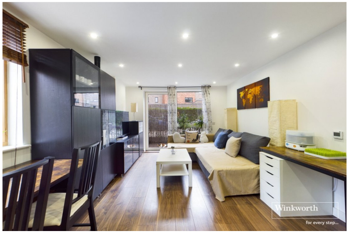
ARMSTRONG ROAD, LONDON, NW10 £285,000 LEASEHOLD