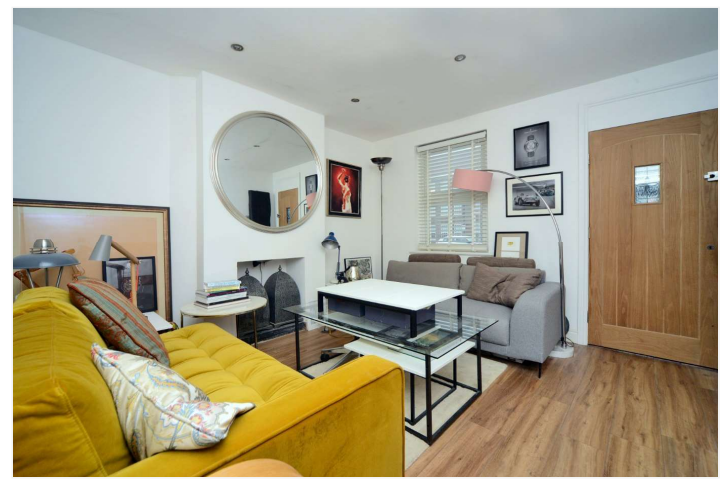
CHEAM COMMON ROAD, WORCESTER PARK, KT4 OIEO £450,000 FREEHOLD

A CONTEMPORARY STYLE TWO BEDROOM, TWO BATHROOM PROPERTY WITH OPEN-PLAN LIVING SPACE, OFF STREET PARKING AND A 100FT APPROX. REAR GARDEN