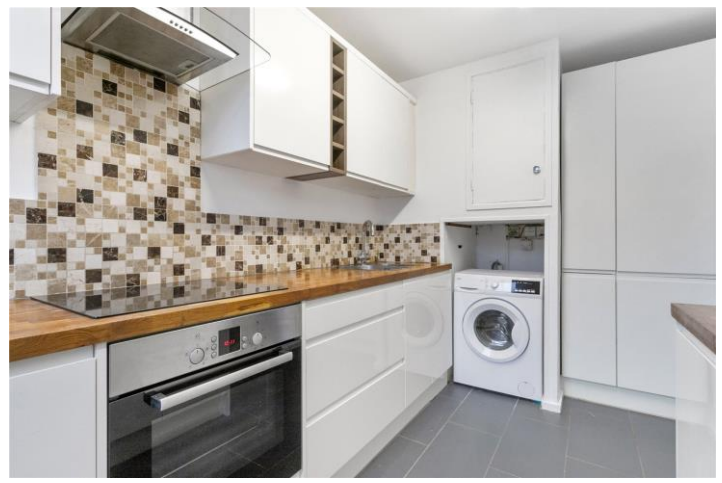
OATFIELD HOUSE, PERRY COURT, LONDON, N15 £200,000 LEASEHOLD