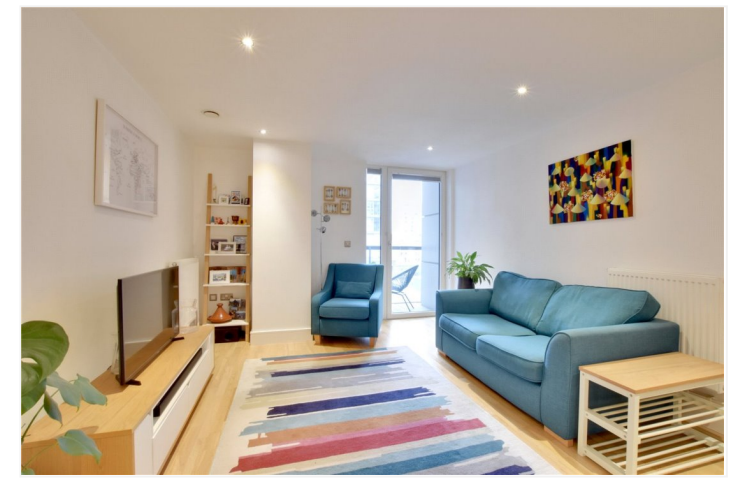
CANARY VIEW, GREENWICH, LONDON, SE10 £420,000 LEASEHOLD

A STUNNING AND SPACIOUS ONE BEDROOM APARTMENT THAT MEASURES AN IMPRESSIVE 627 SQUARE FOOT, AND LOCATED WITHIN THIS OUTSTANDING RIVERSIDE DEVELOPMENT. EWS1 COMPLIANT!