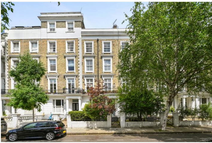
DURHAM TERRACE, W2 £1,300,000 SHARE OF FREEHOLD

A VERY SPACIOUS AND BRIGHT THREE BEDROOM GARDEN MAISONETTE IN THIS MUCH SOUGHT AFTER AND PEACEFUL ENCLAVE IN NOTTING HILL.