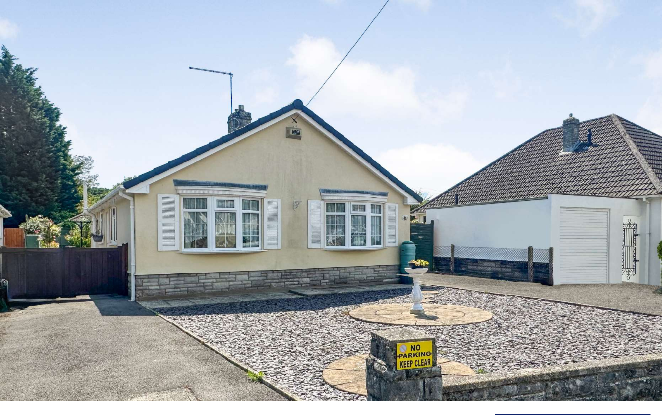
38 Linden Road West Parley, Ferndown BH22 8RR Offers Over £425,000